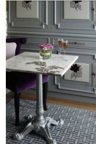
Mother of Pearl Inlay – Dining Room