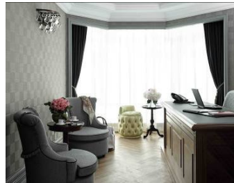
The Ante Room